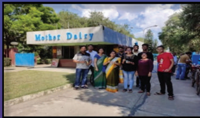
Industrial visit to Mother Dairy plant, Dankuni