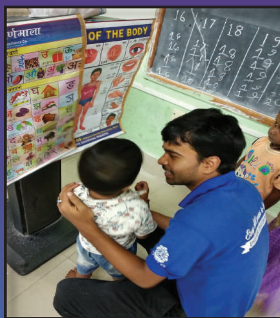
Bihari More Education Project, a volunteer driven Independent Social Initiative by NIT Durgapur Students mentors the under-privileged children in & around the Campus.