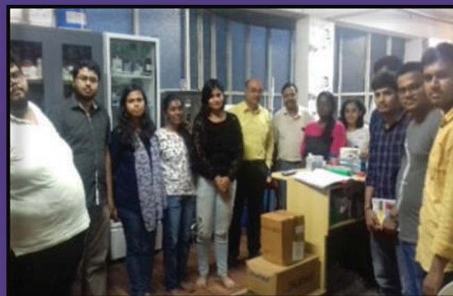
Industrial visit to Bio Bharati Live Science Pvt. Ltd, Kolkata