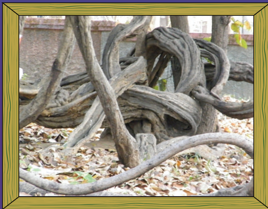
BONDING : Our Heritage Tree